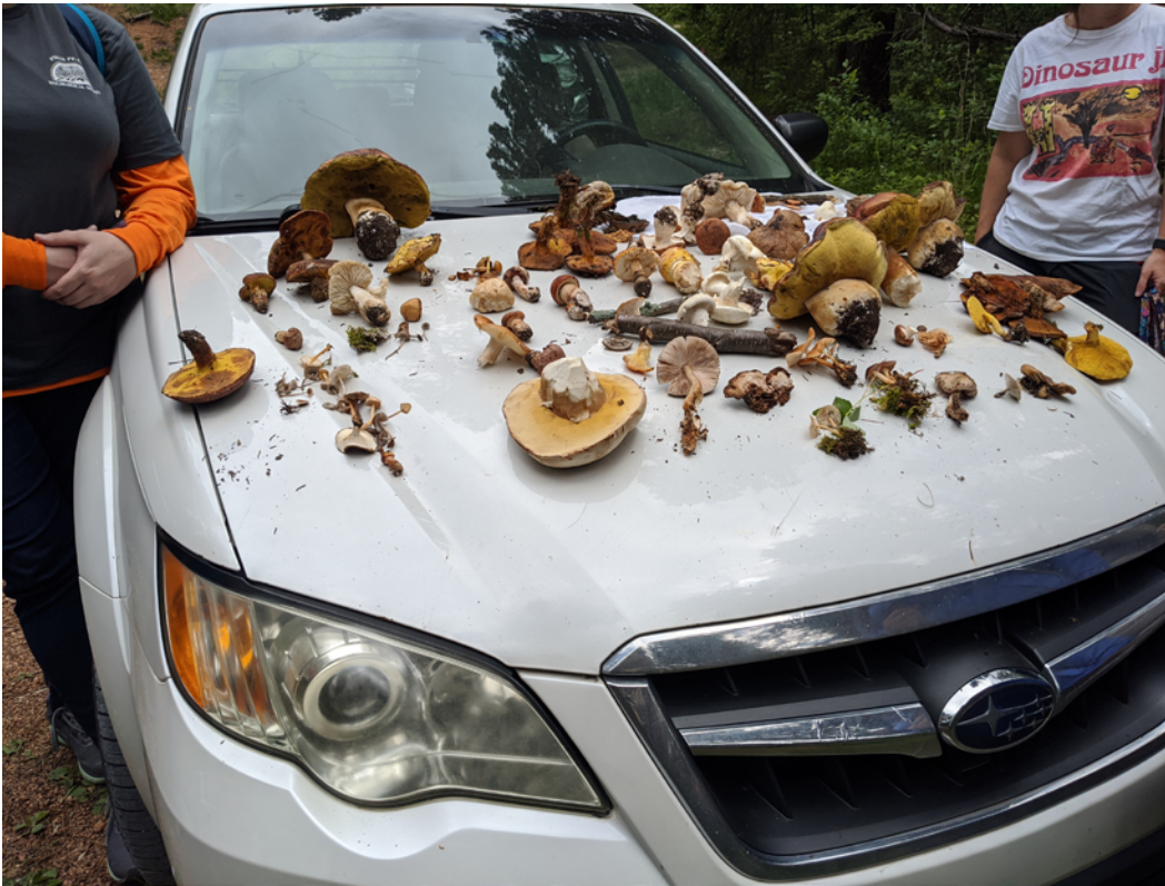
PPMS fory June 30, 2021