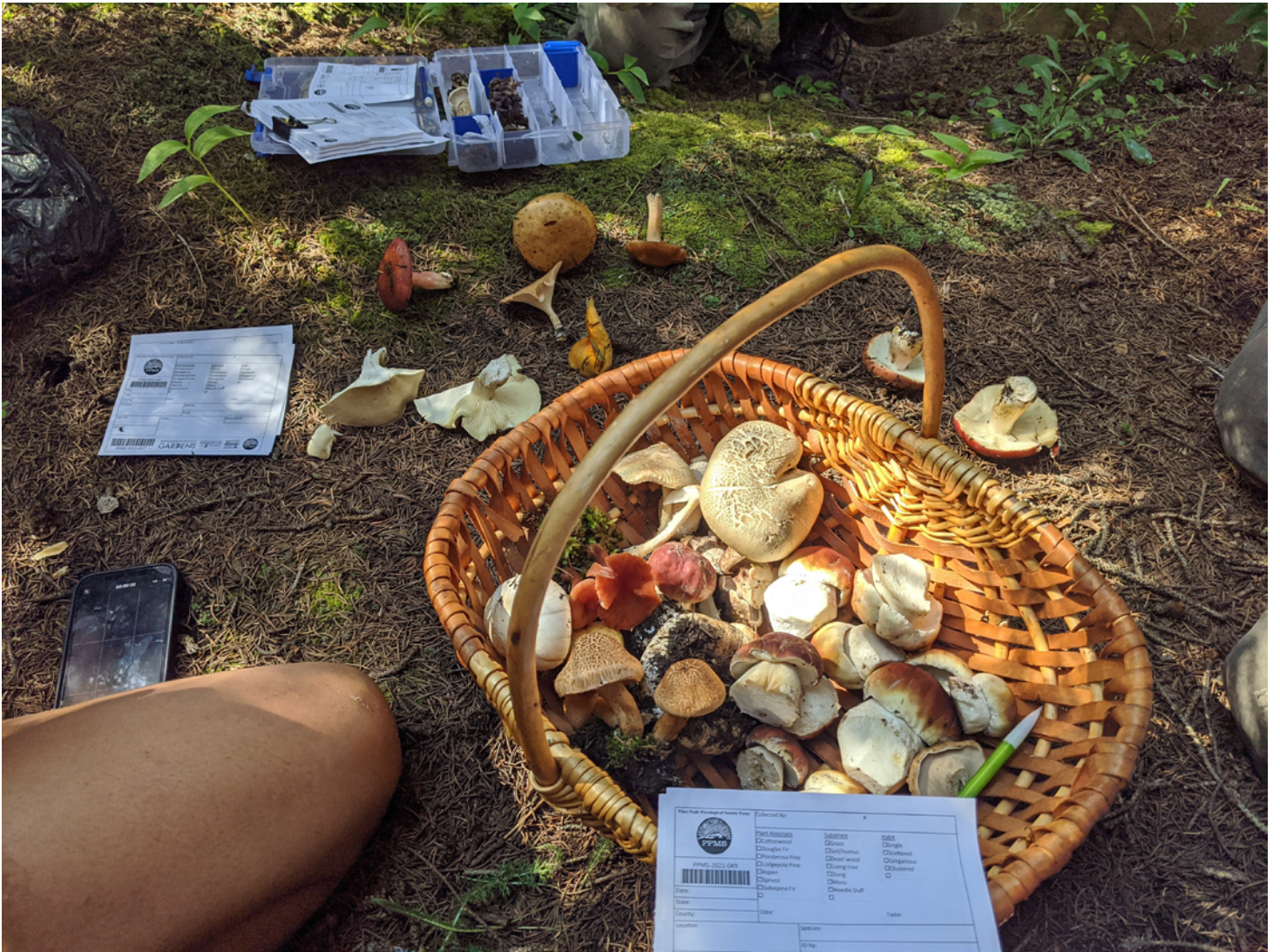
Collecting for the Fungal Diversity Project at the Craggs foray July 28, 2021