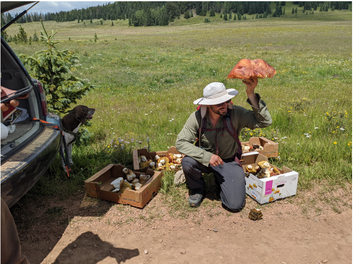
PPMS members displaying their haul of choice edibles found on the overnight foray in the Wet Mountains July 29, 2021