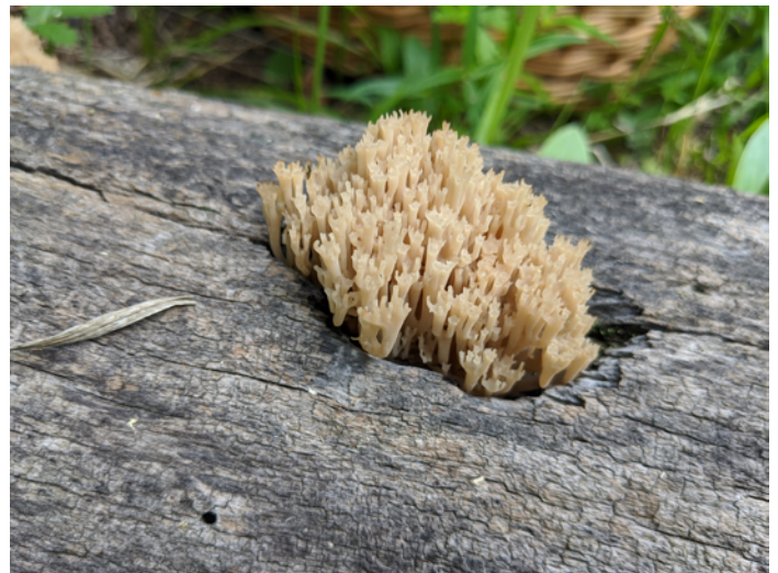
PPMS fory June 30, 2021