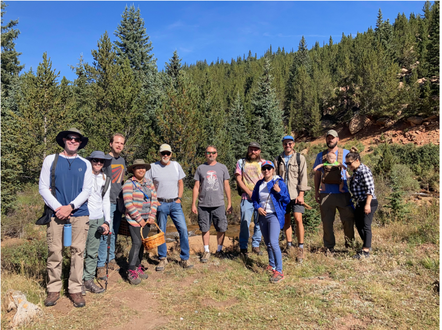
club members on a foray on the back of Pikes Peak in mid-September