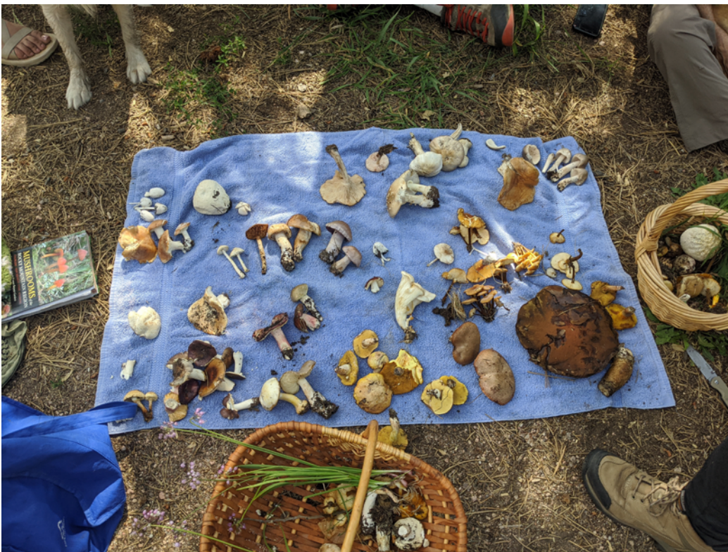
Crags foray July 21, 2021