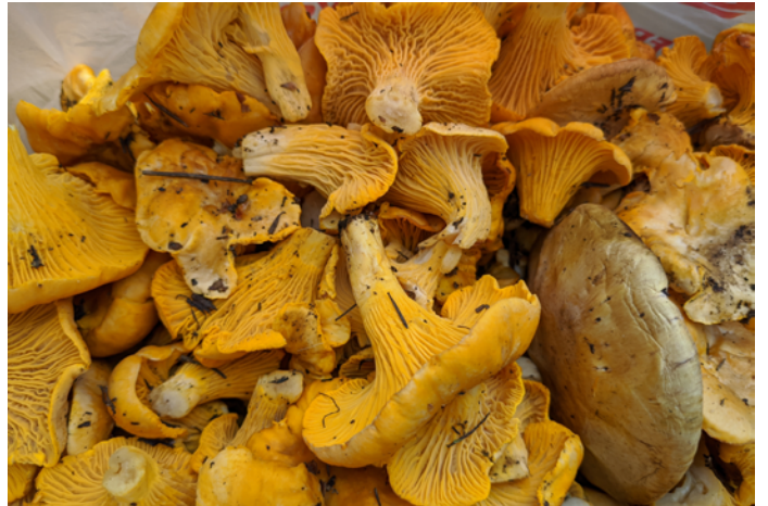
Catamount Trail foray August 8, 2021