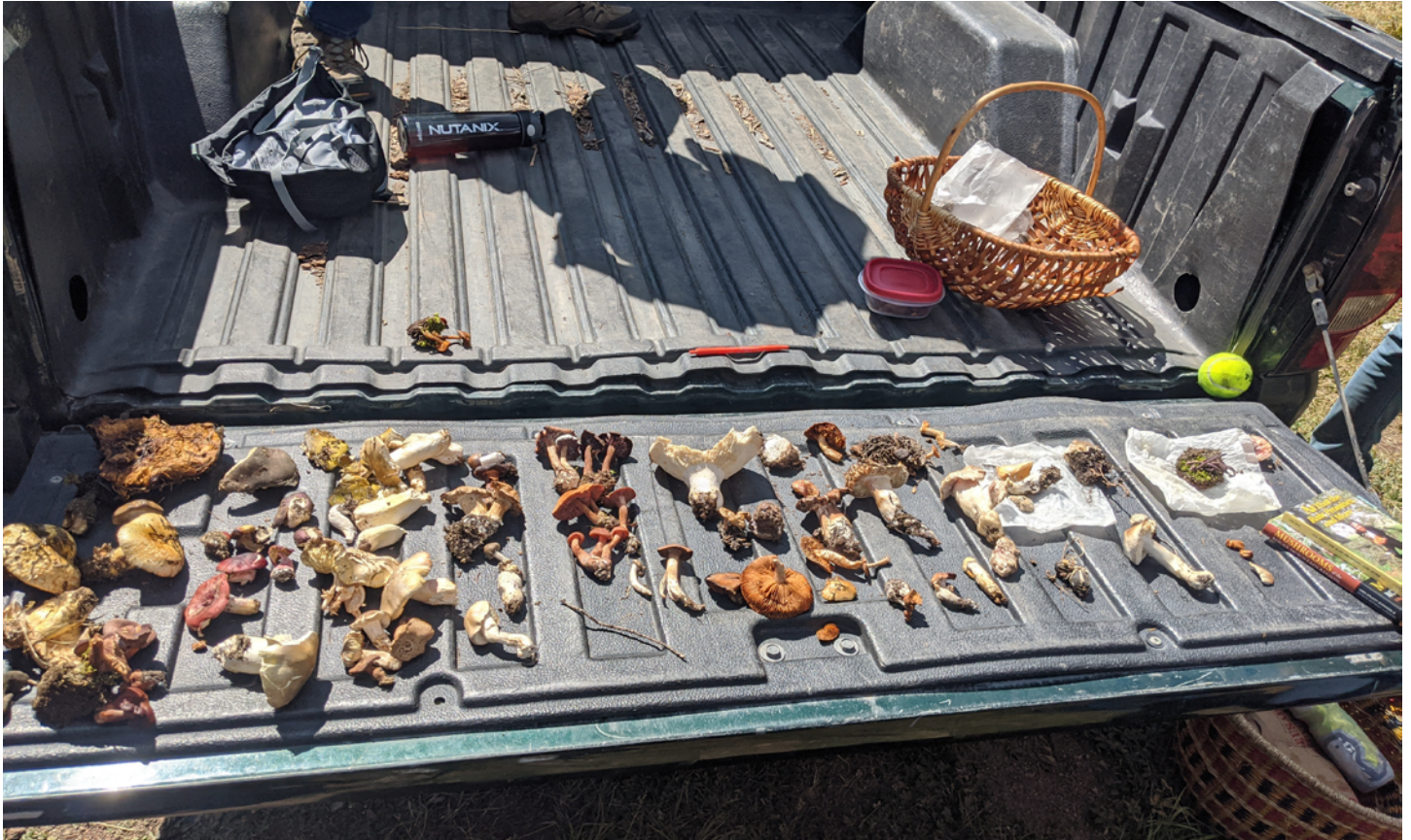
foray on the back of Pikes Peak in mid-September