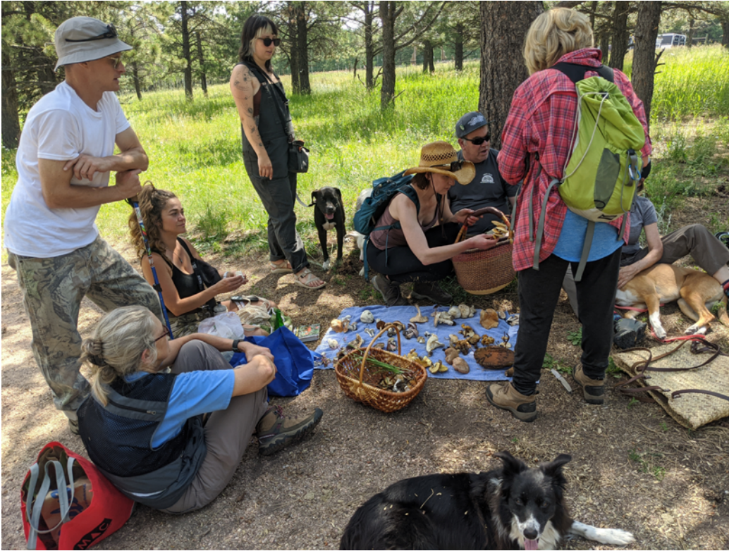
Crags foray July 21, 2021