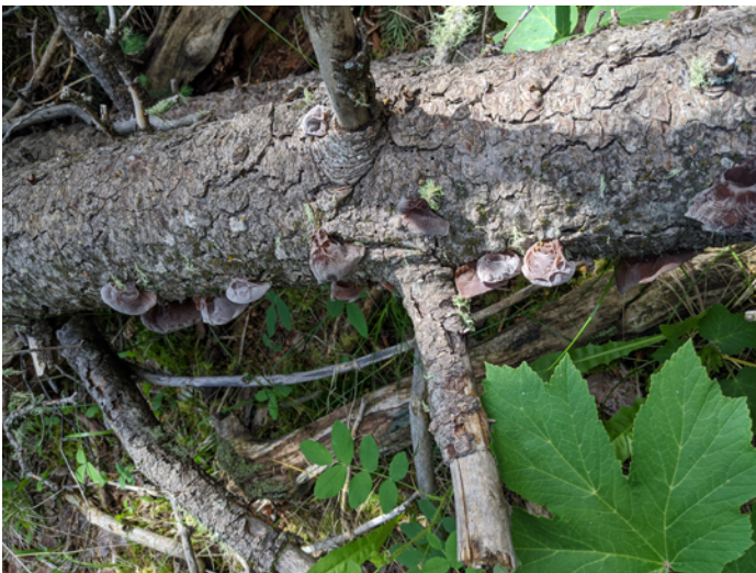
PPMS fory June 30, 2021