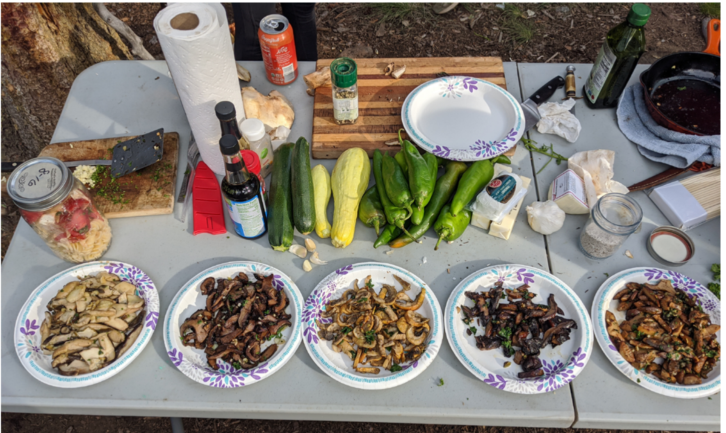
PPMS overnight foray in the Wet Mountains July 29, 2021