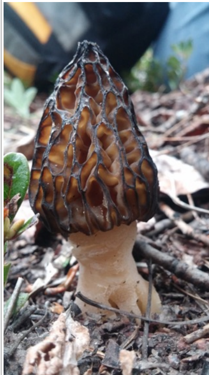
from the June 6 foray.