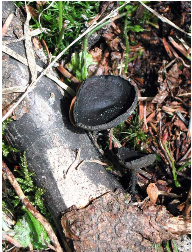
Plectania nannfeldtii