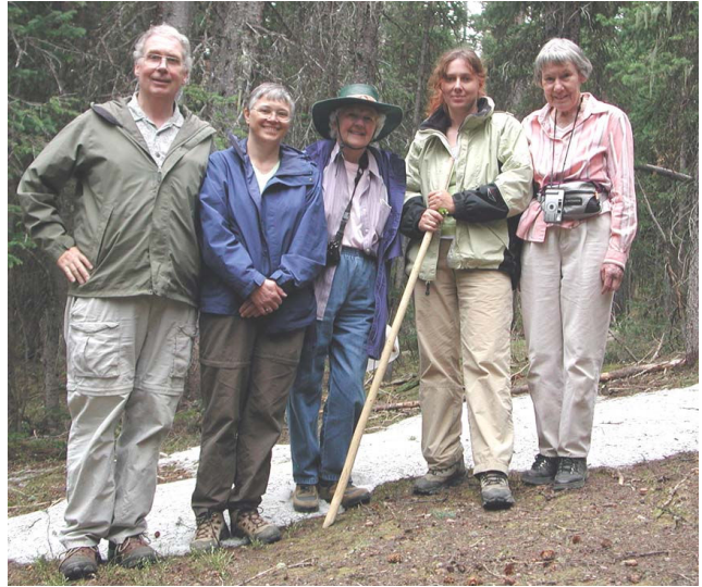
June 7, 2006 snow bank mushroom foray