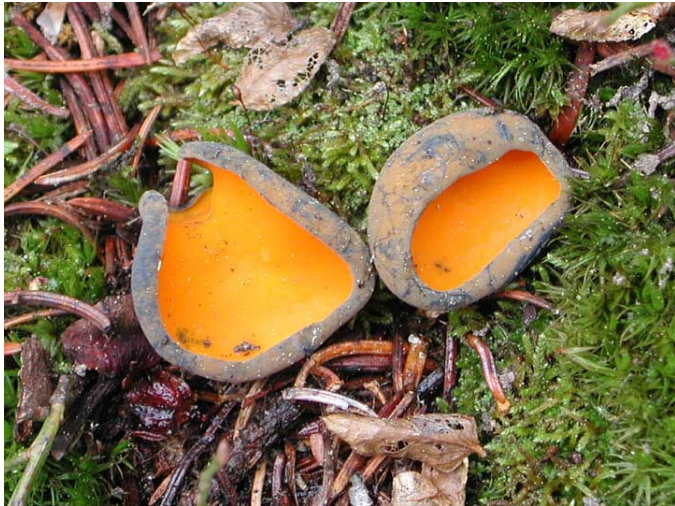
Caloscypha fulgens